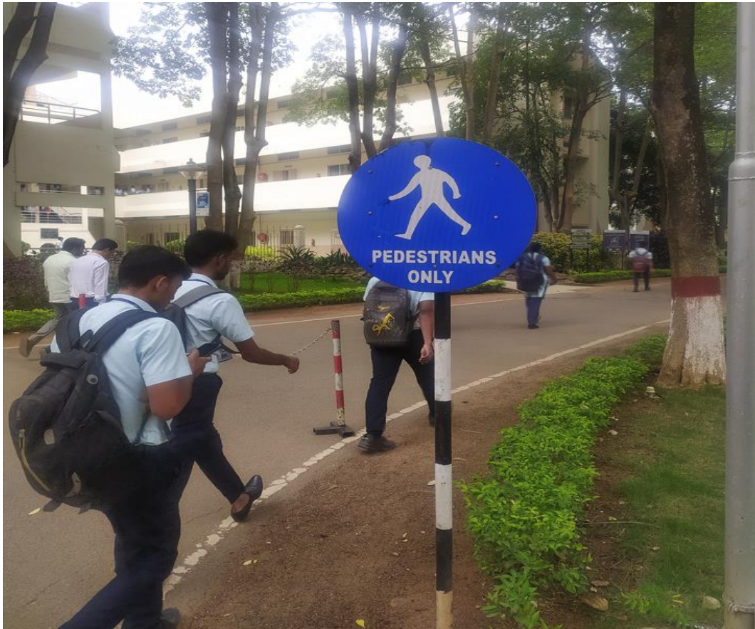
Fig. 1: "Pedestrians Only" Lane

In GMRIT campus the pedestrians are given priority (Fig. 1 to Fig. 5). Pedestrian lanes have been prioritized by proper sign boards in different areas inside campus to ensure students' and employees' safe passage. Speed limit of vehicles inside the campus has been limited 30 km per hour only and the institute is a no-horn place. Speed breakers are also built on the roads. Security personnel from the institute provide assistance to students and employees while crossing the streets to ensure safety while going to and from the institute. The traffic sign boards are placed at appropriate place for the safety of the pedestrians (Fig. 6 to Fig. 11).