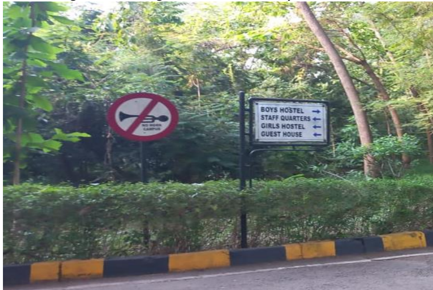
Fig. 11: Traffic sign board for the safety of commuters