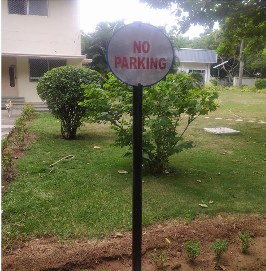
Fig. 10: Traffic sign board for the safety of commuters