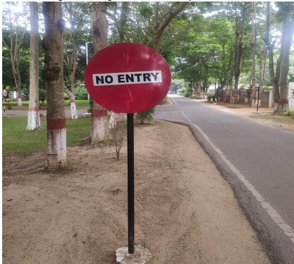
Fig. 9: Traffic sign board for the safety of commuters