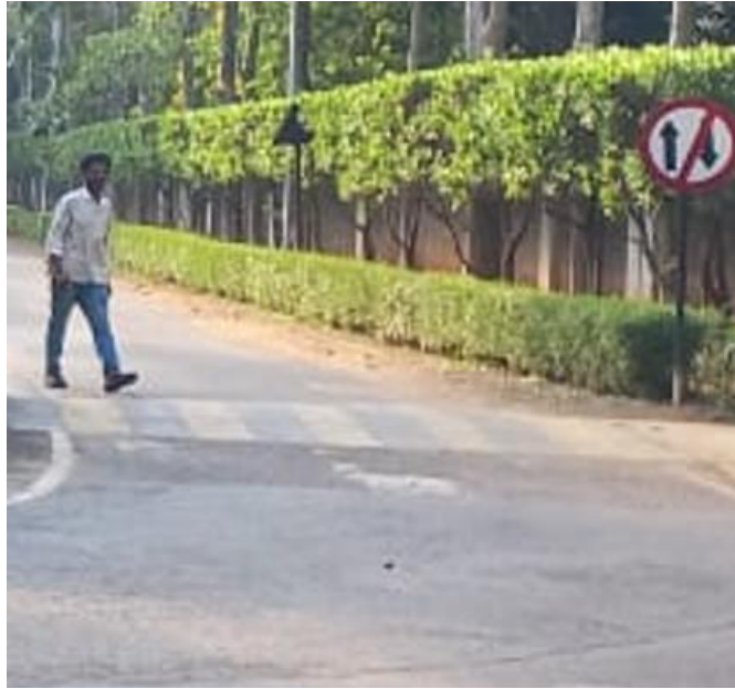
Fig. 6: Traffic sign board for the safety of commuters