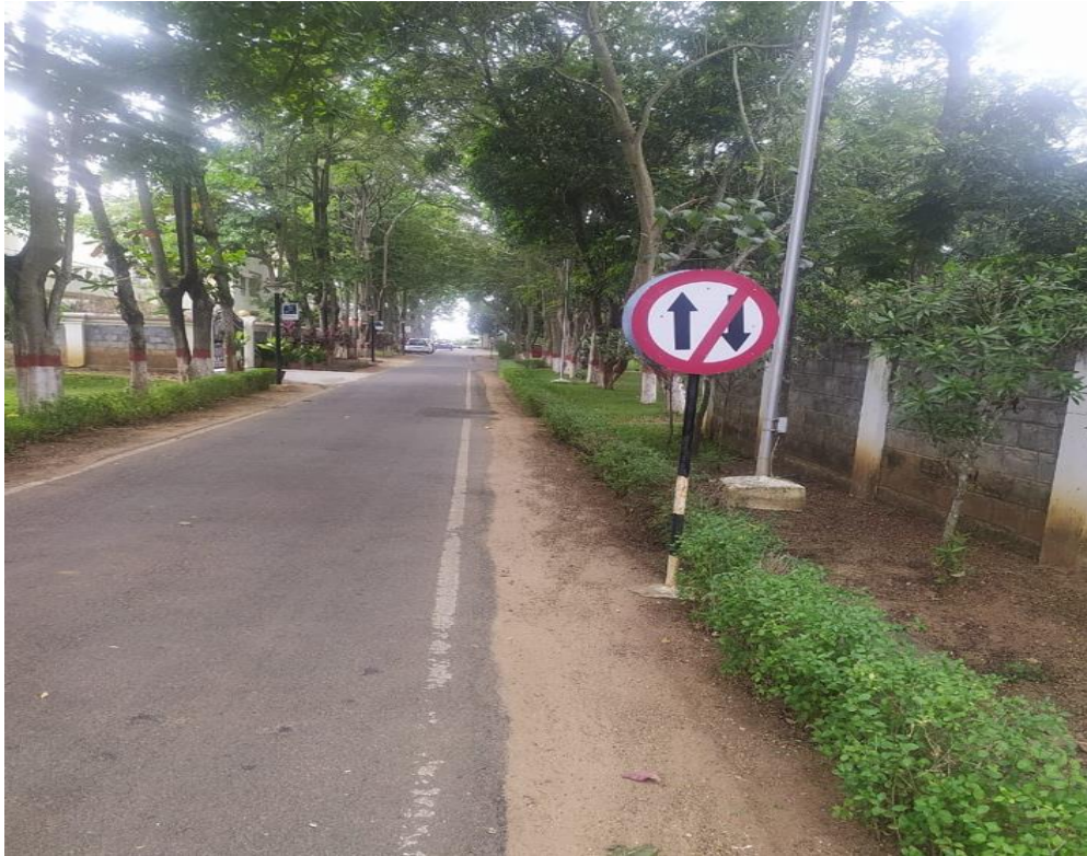
Fig. 8: Traffic sign board for the safety of commuters