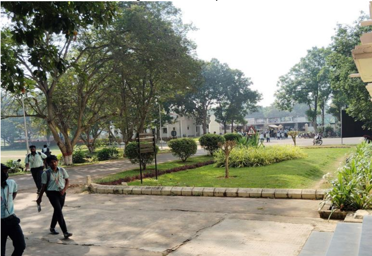
Fig. 5: "Pedestrians Only" Lane