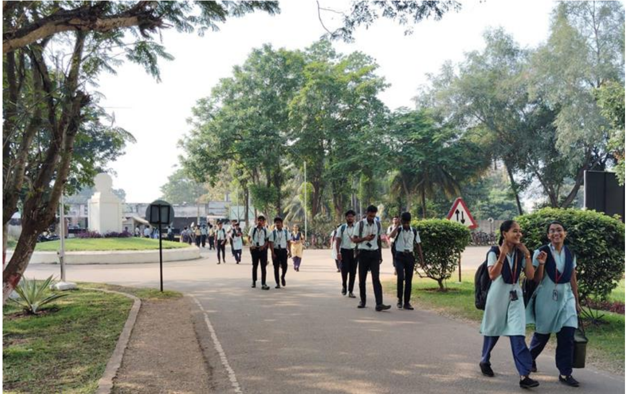
Fig. 4: "Pedestrians Only" Lane