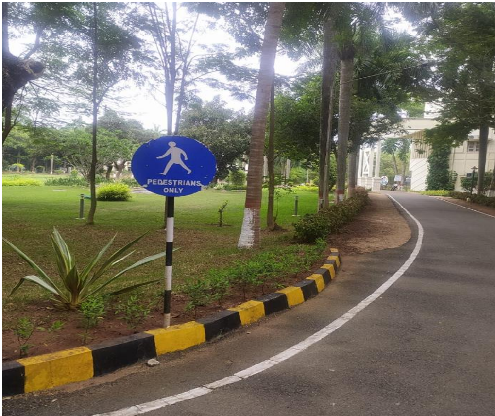
Fig. 2: "Pedestrians Only" Lane