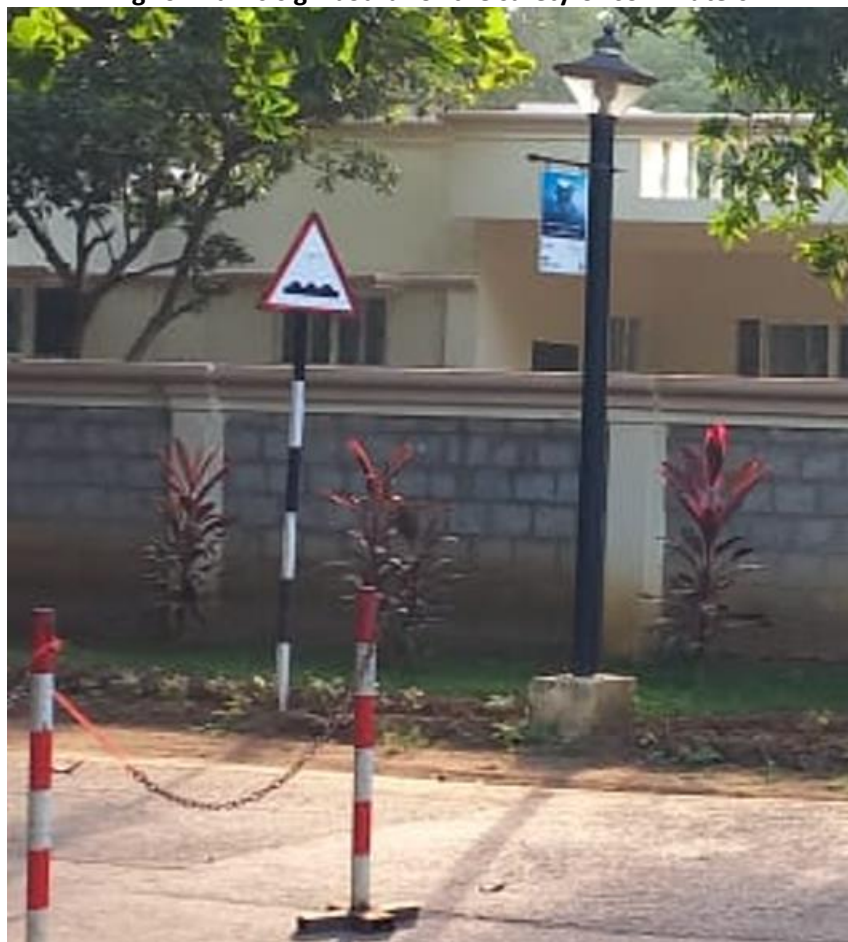
Fig. 7: Traffic sign board for the safety of commuters